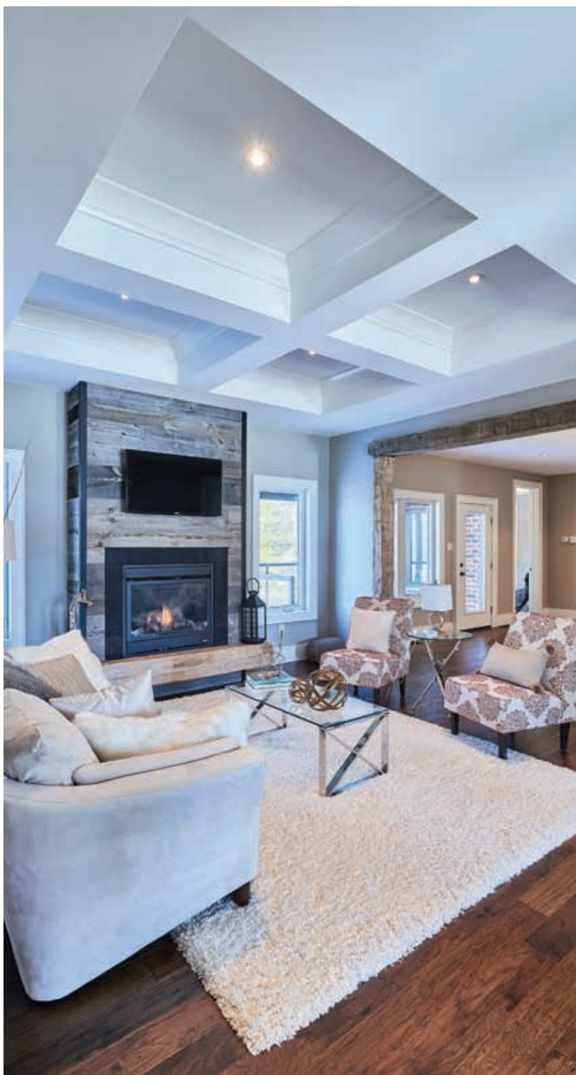
First of the many dramatic focal points in the home – a barn wood fireplace surround that travels all the way to the nine-foot ceiling. A hefty barn beam acts as the hearth.