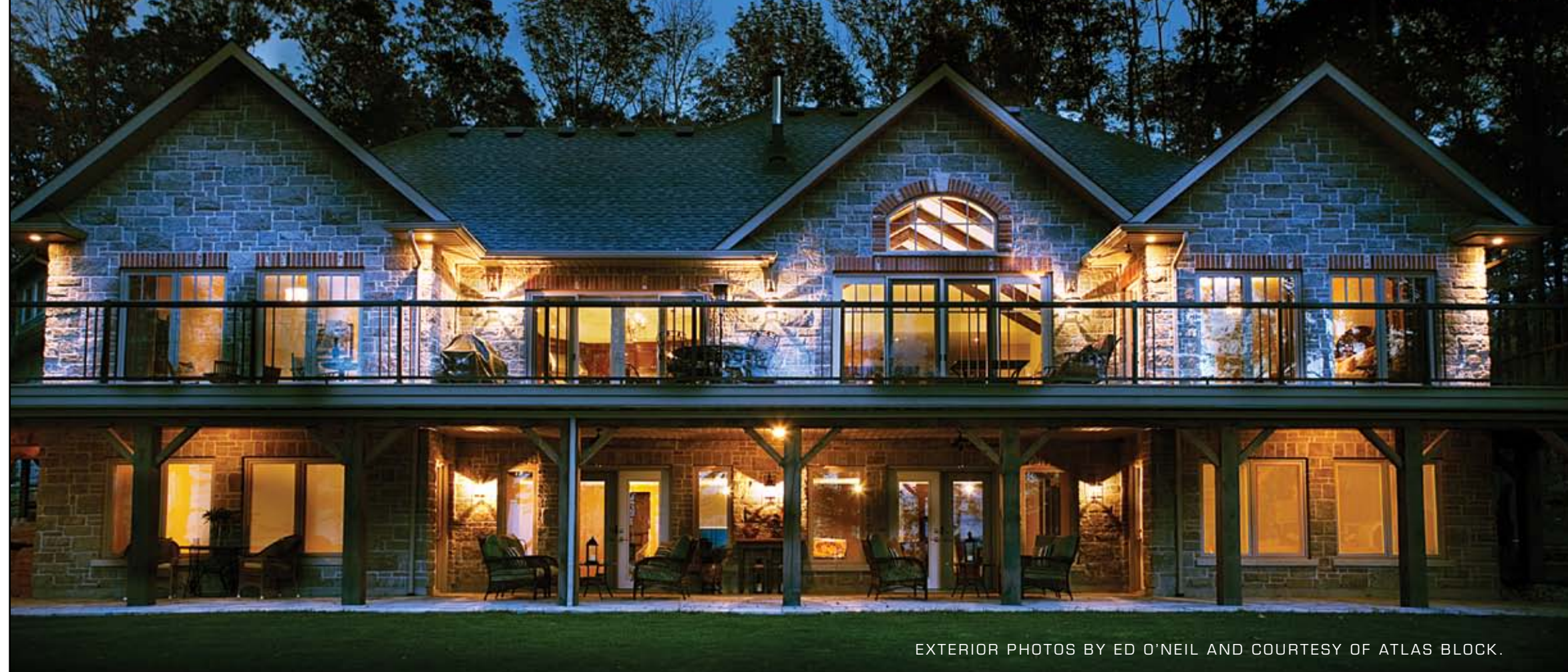
EXTERIOR PHOTOS BY ED O'NEIL AND COURTESY OF ATLAS BLOCK.

The foyer opens to the elegant great room where texture and rich neutral hues bring the room to life. A dry-stacked stone, double-sided fireplace is the focal point. Continued on page 52