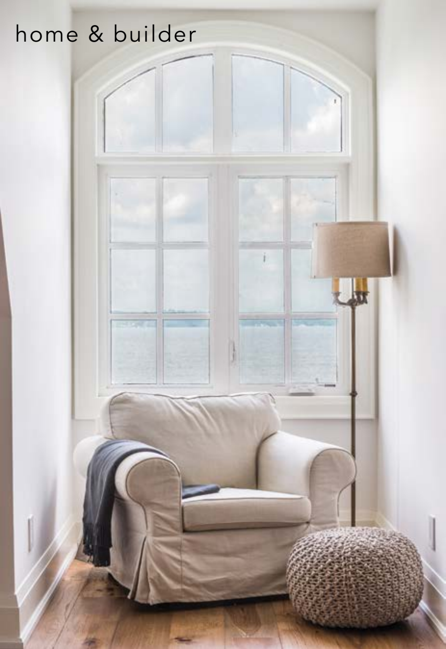
Guests have their own, beautifully decorated space. The cottage space above the garage includes a living room, bedroom with a desk nook and a full bath. This soft carpet in this bedroom, from Irvine Carpet One Floor & Home, resembles straw.